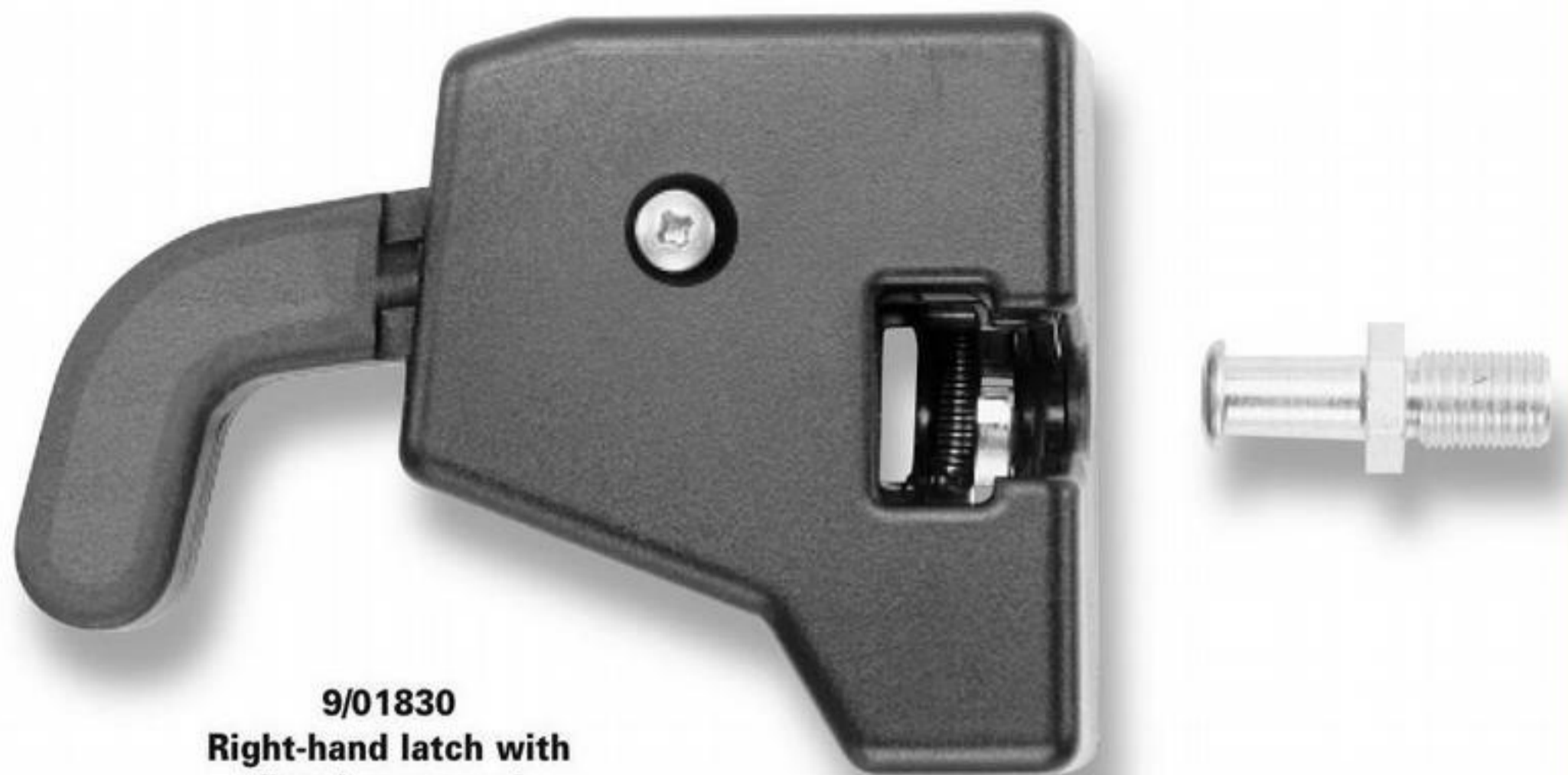
9/01830 Right-hand latch with fitted cover and integral inside handle