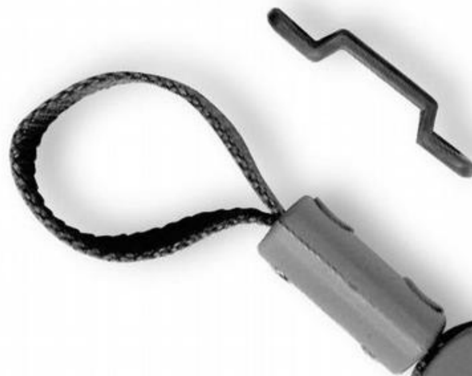
9/01746 Hanging-strap handle