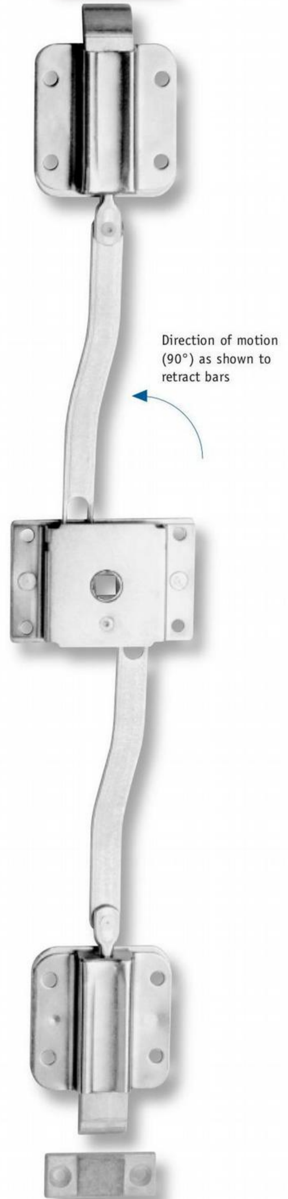
Complete right-hand slam system 9/02058 (includes all items shown) shown fully extended from inside.

Full system includes end-latches (3/22387) Striker plates (3/12341), rivets (19-7), and wave washer (58-21).