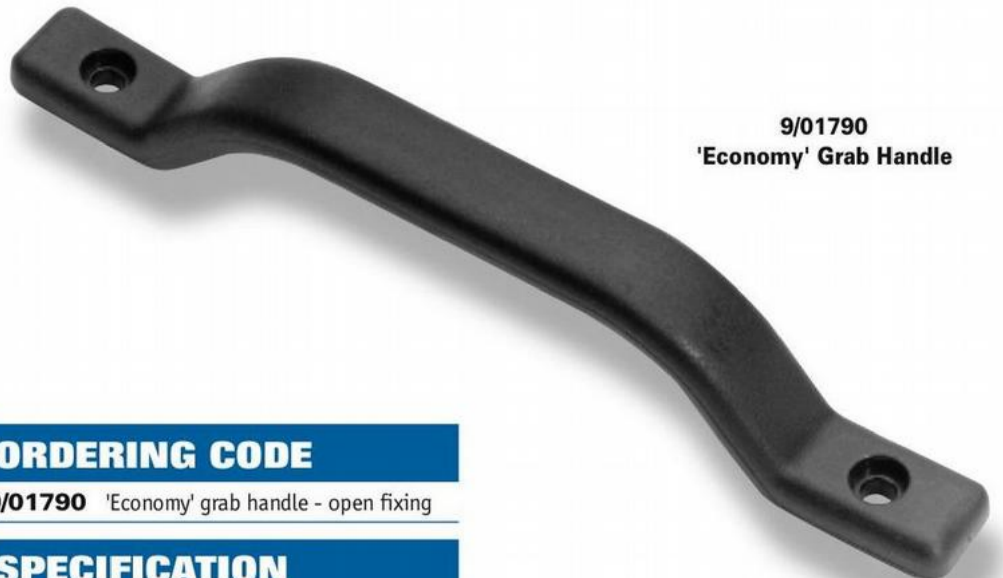
9/01790 'Economy' Grab Handle