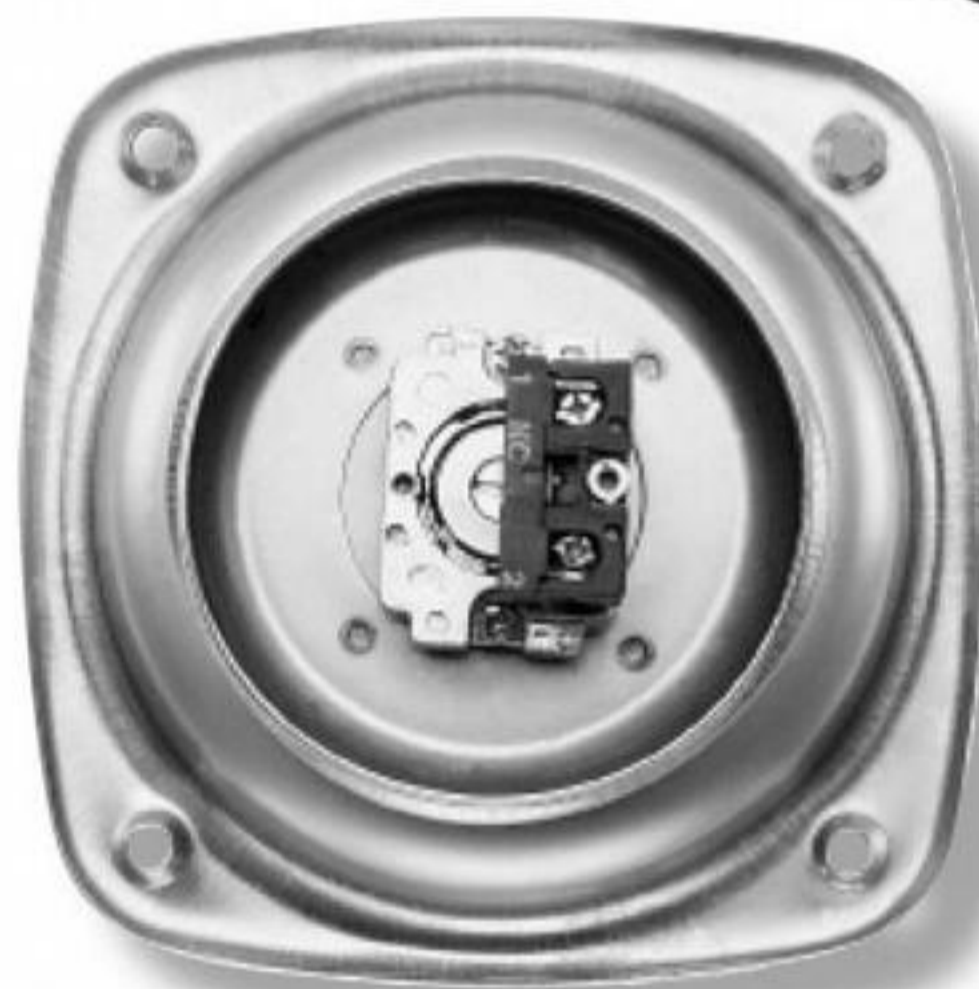
Rear-view of assembled switch and recess pan