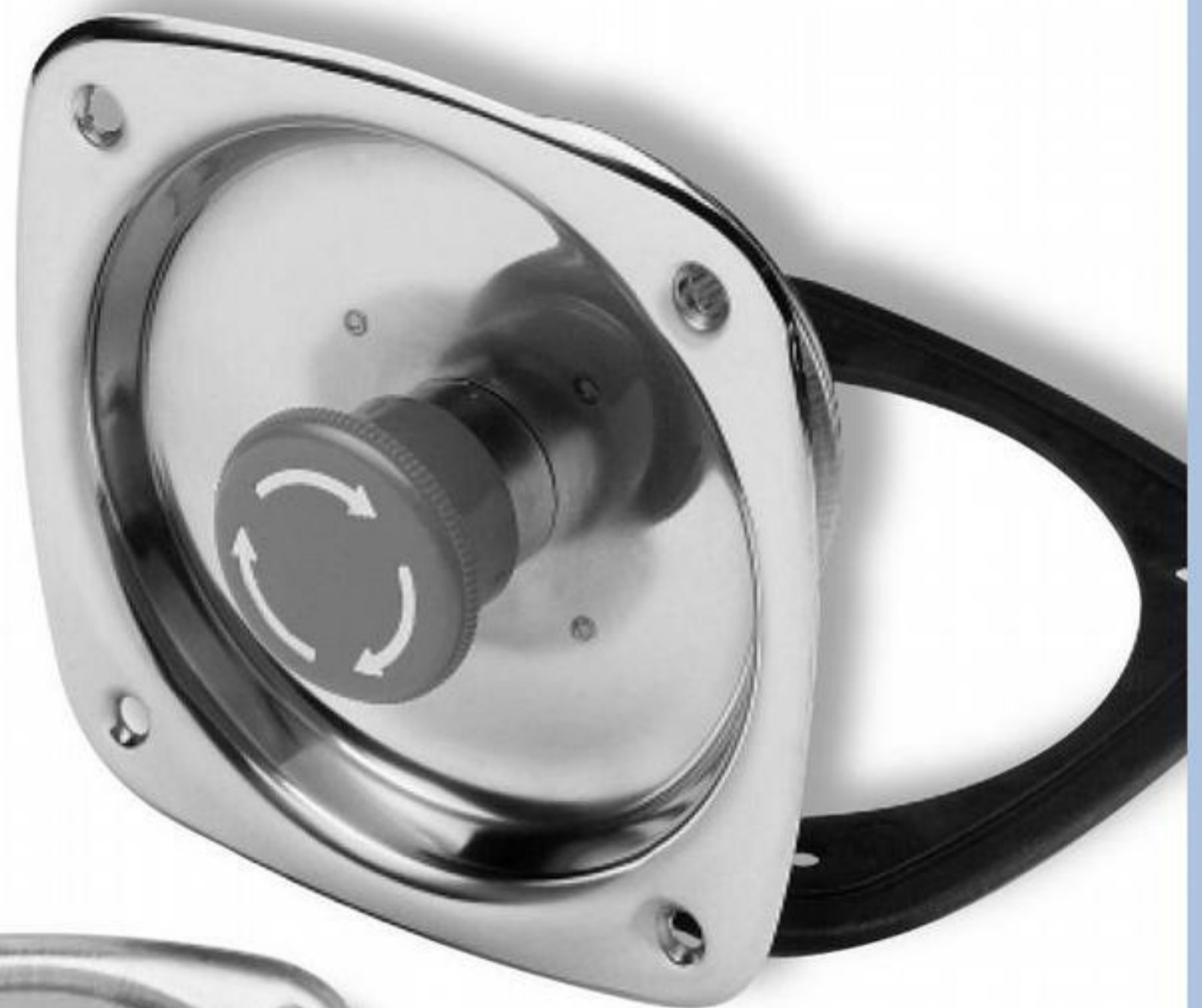
9/01433 & 9/01463 Emergency stop switch assembled into recess pan