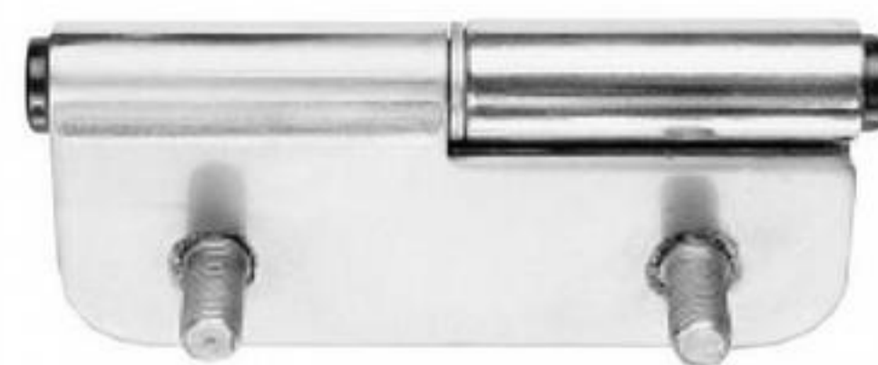
Illustration shows welded studs for concealed fixing.