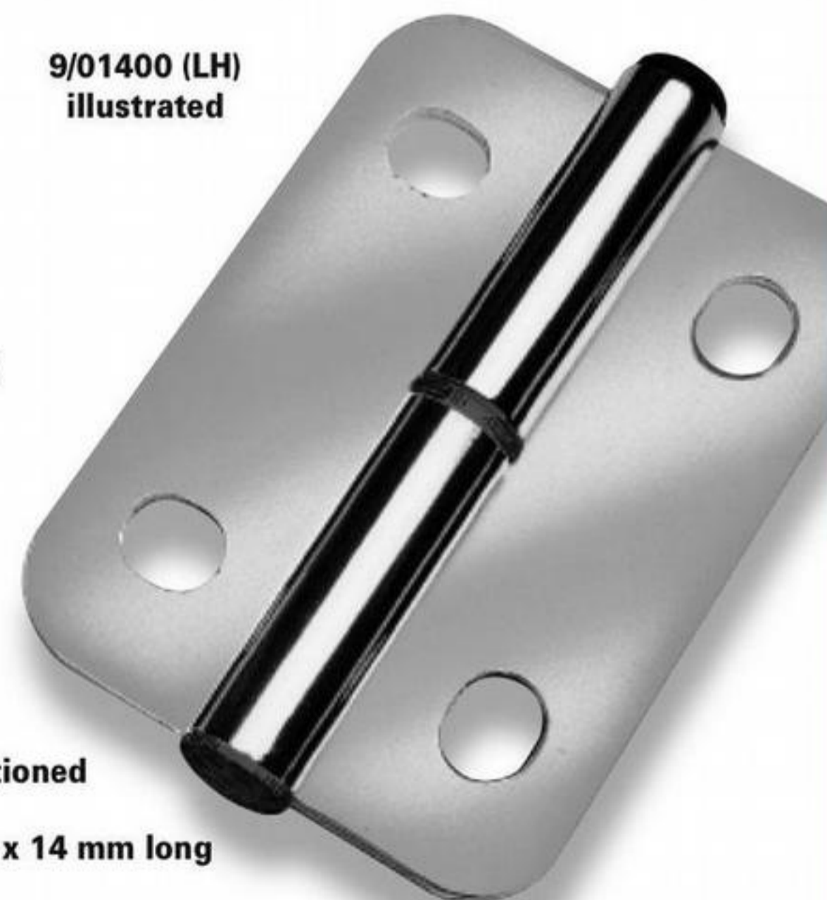
9/01400 (LH) illustrated

4 slots, positioned as shown, 11 mm wide x 14 mm long