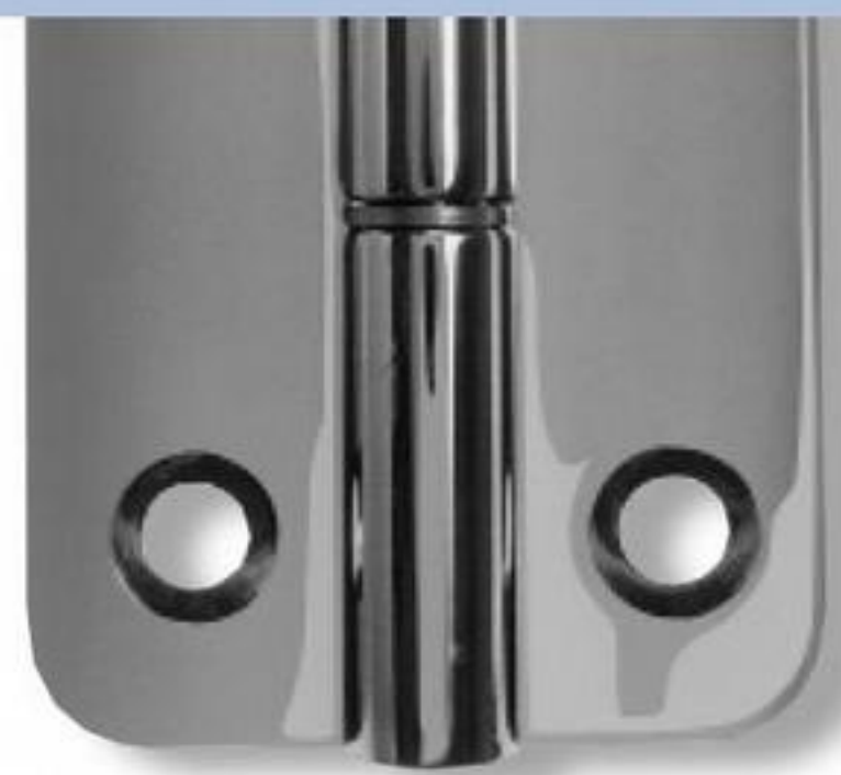
9/01443 LH illustrated