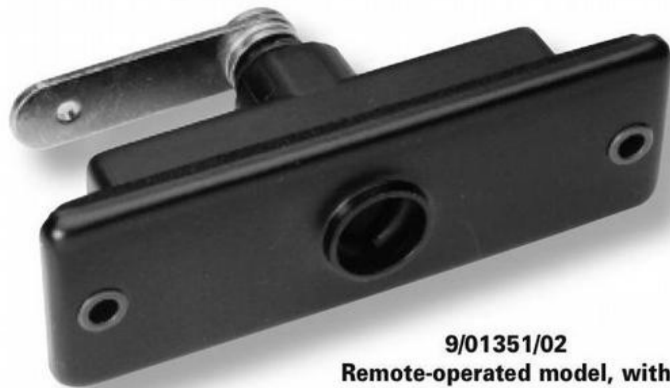
9/01351/02 Remote-operated model, with steel lever and cable-hole.