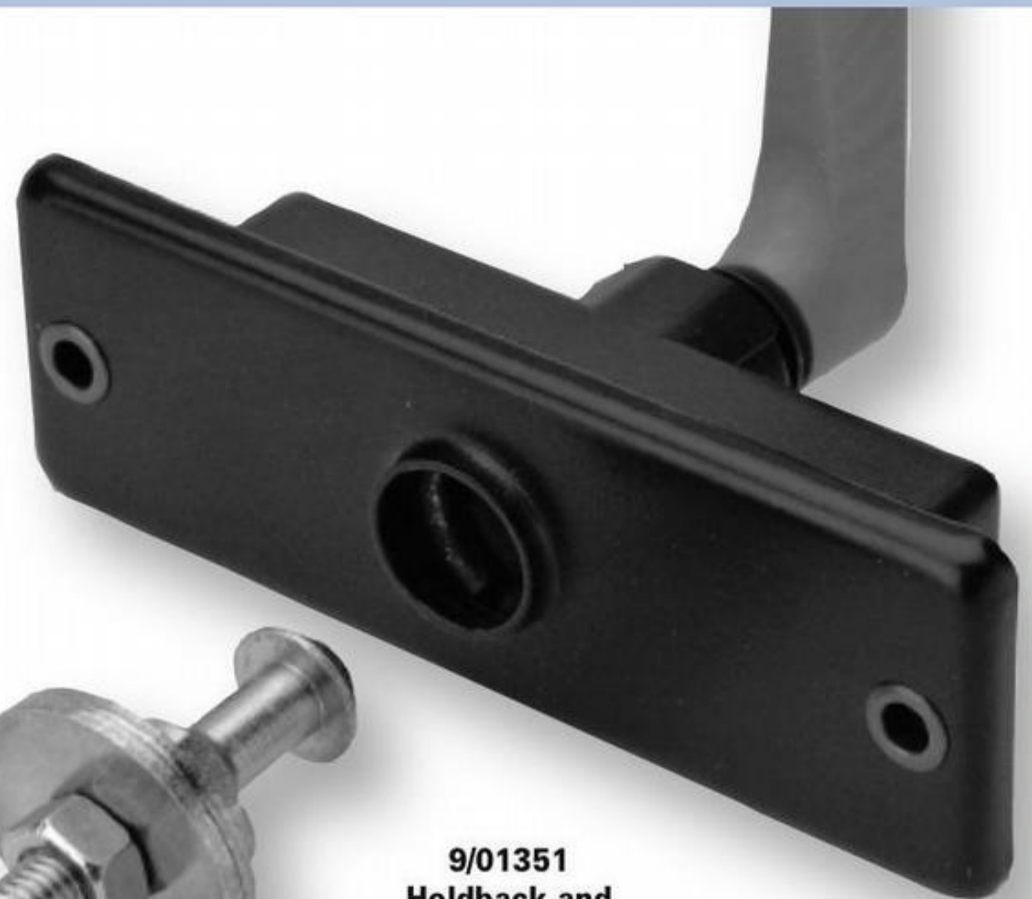
9/01351 Holdback and Striker pin