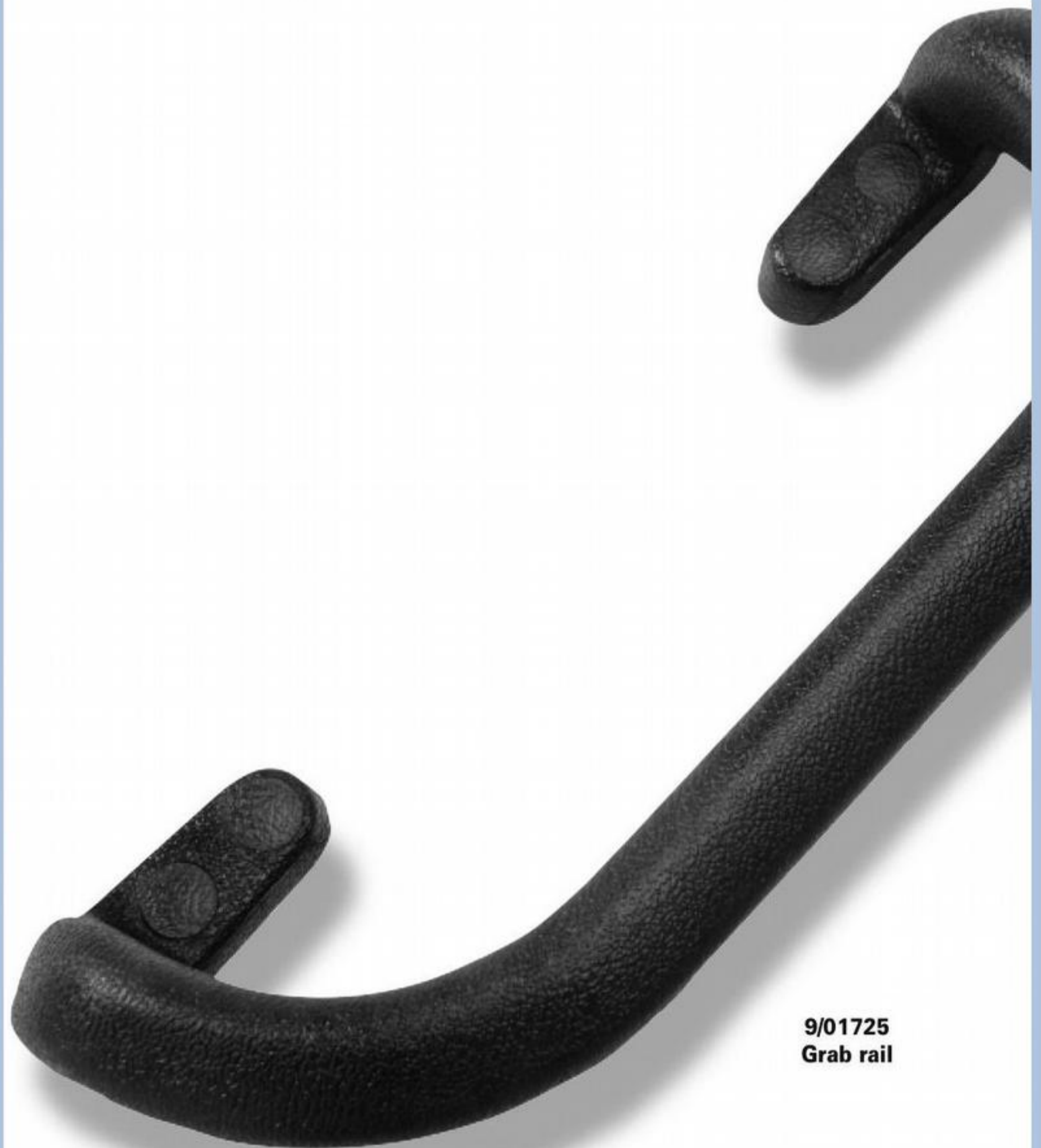
9/01725 Grab rail