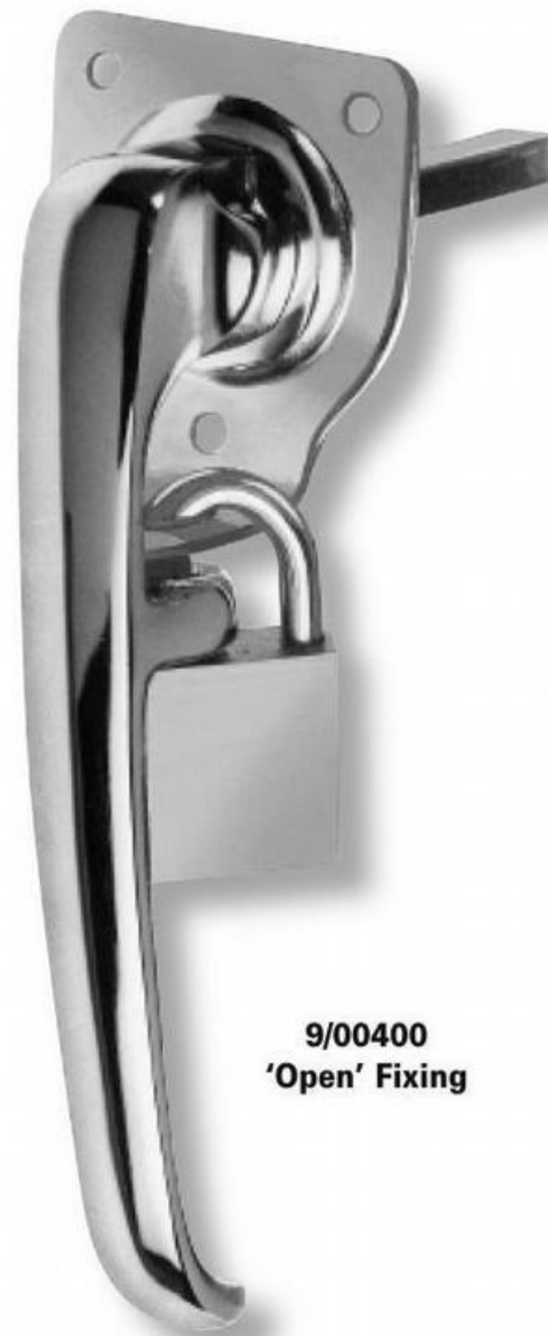
9/00400 'Open' Fixing