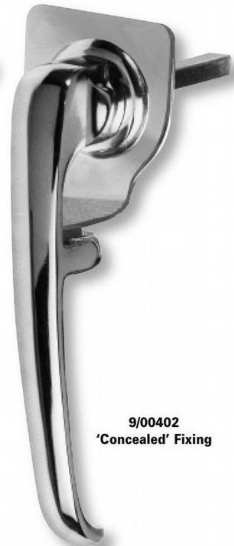
9/00402 'Concealed' Fixing