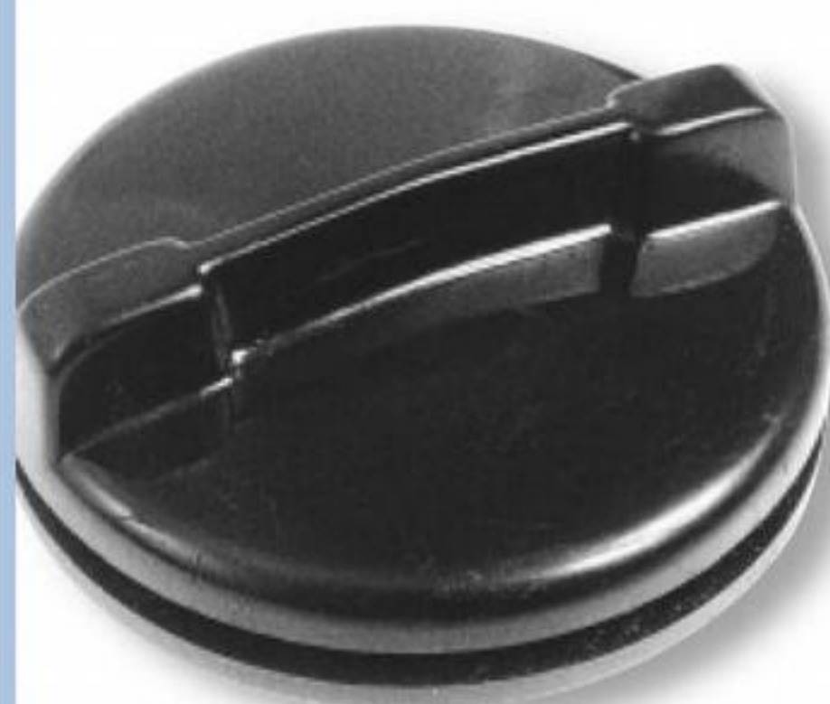
604021 'Finger-bar' cap, black.