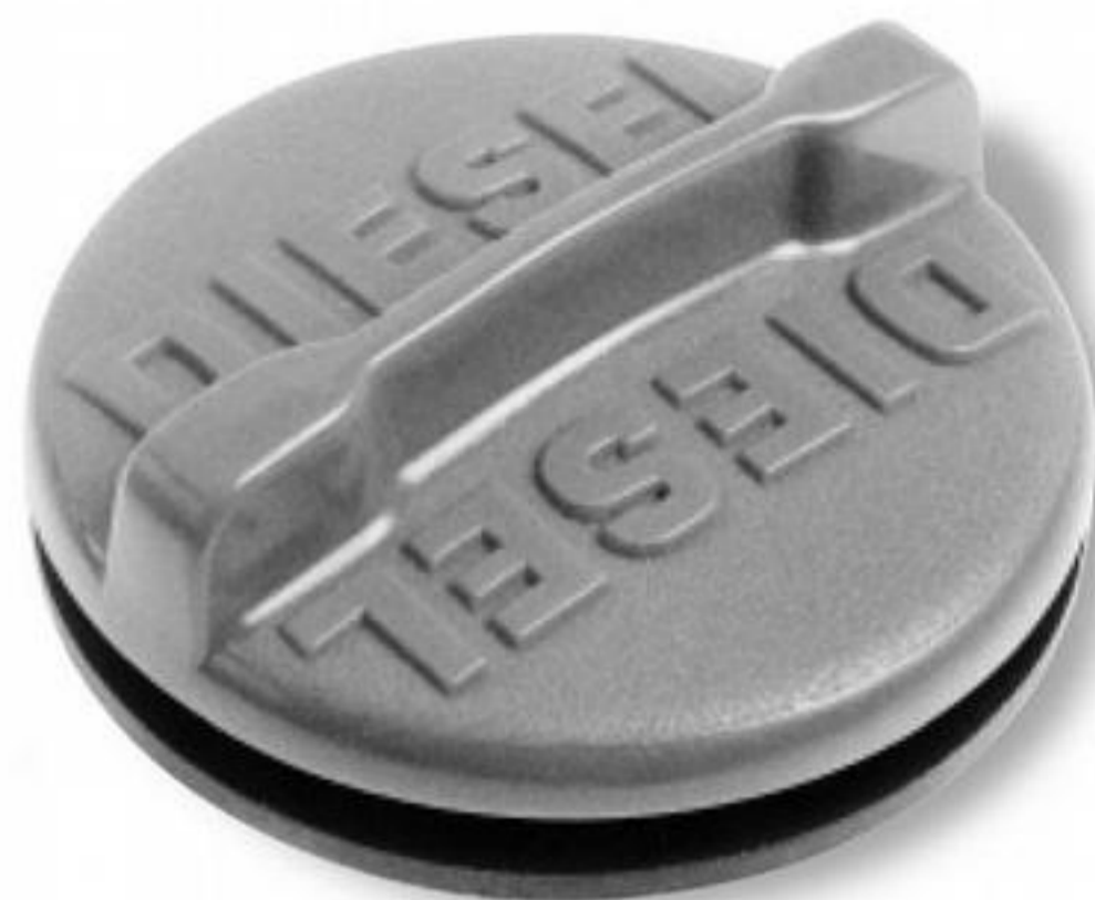
604023 'Diesel' cap, red.