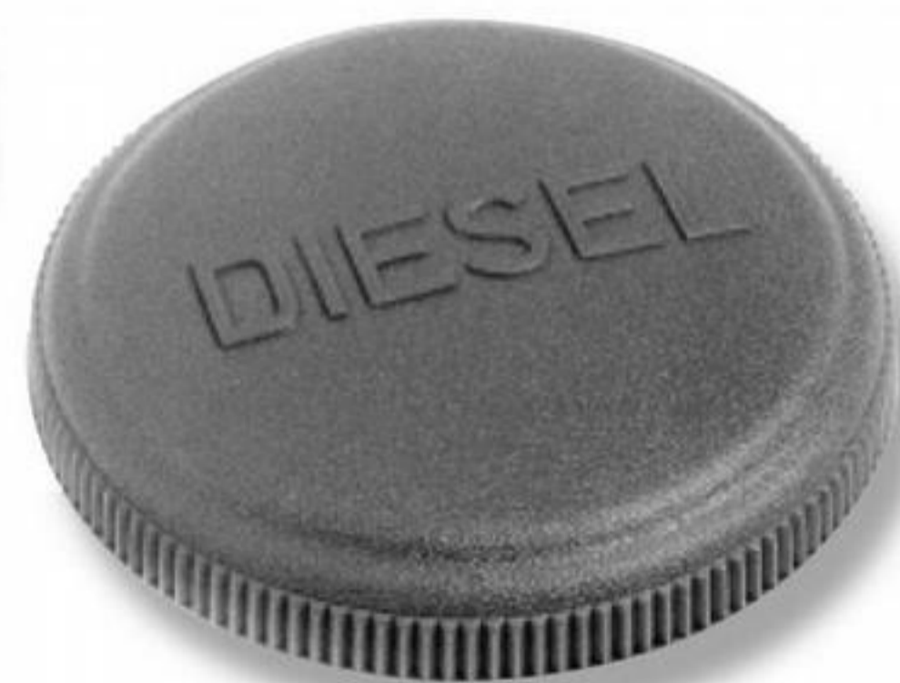
604016 'Diesel' cap, red.