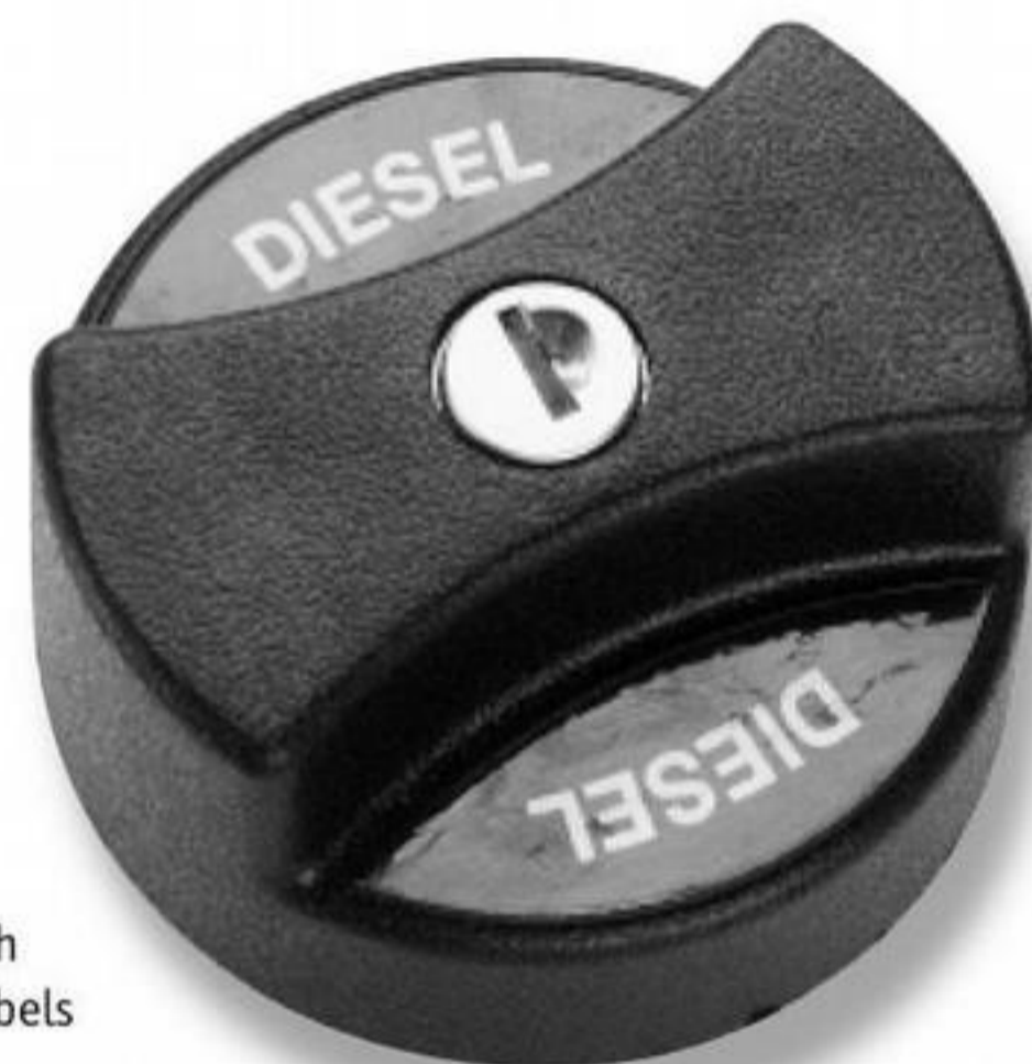
Locking cap with optional 'Diesel' labels