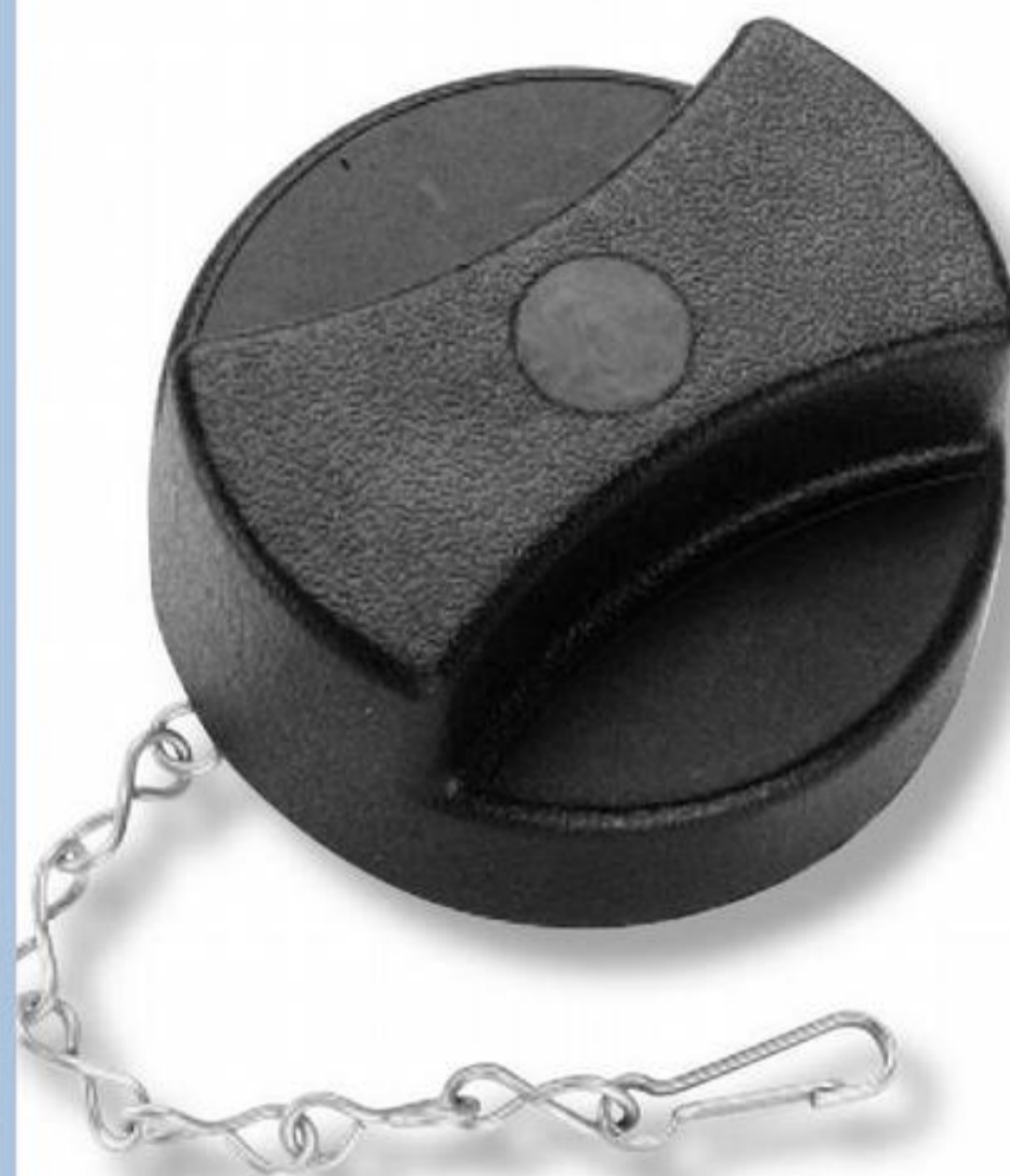
Non-locking cap with optional chain