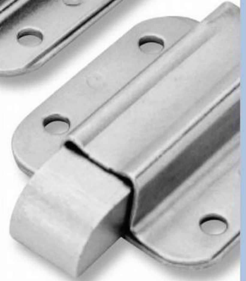
3/22386 with 'quick-fit' attachment point