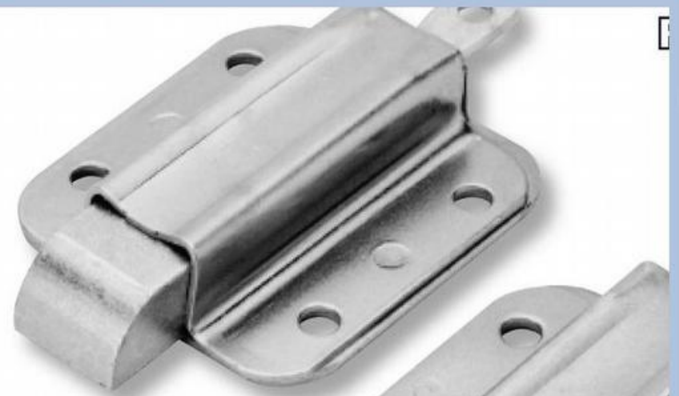
3/22387 with plain bolt-pull