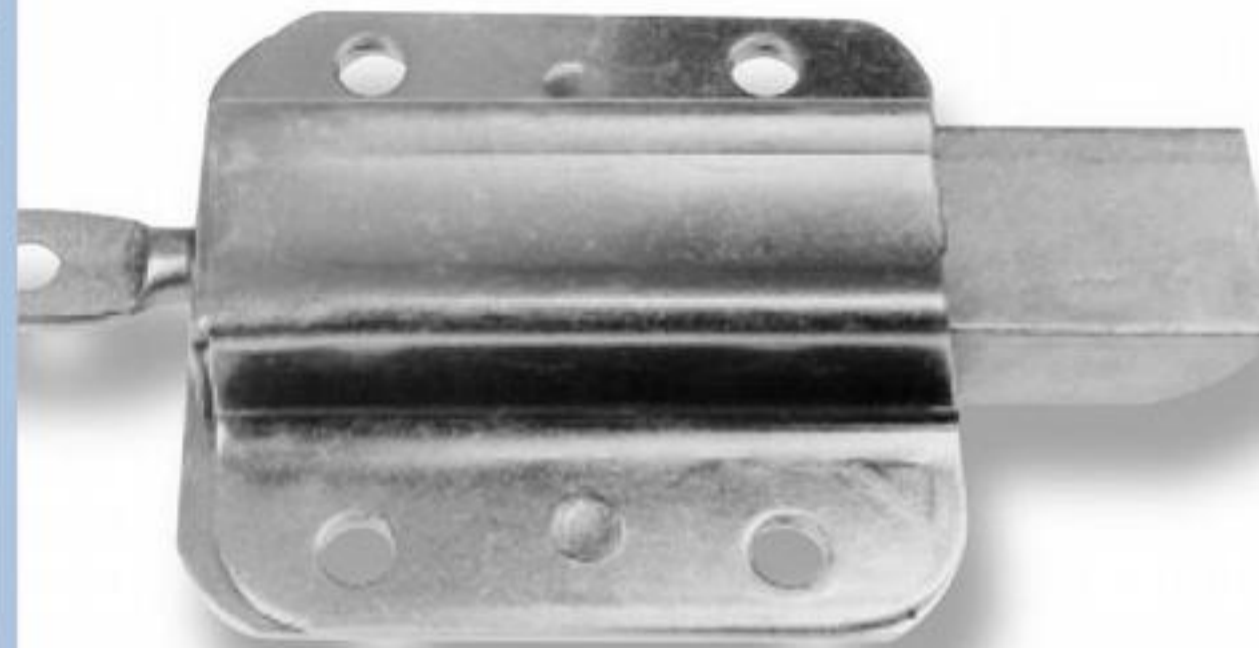
3/22388 'Nose-up' bolt allows use on inward-opening doors