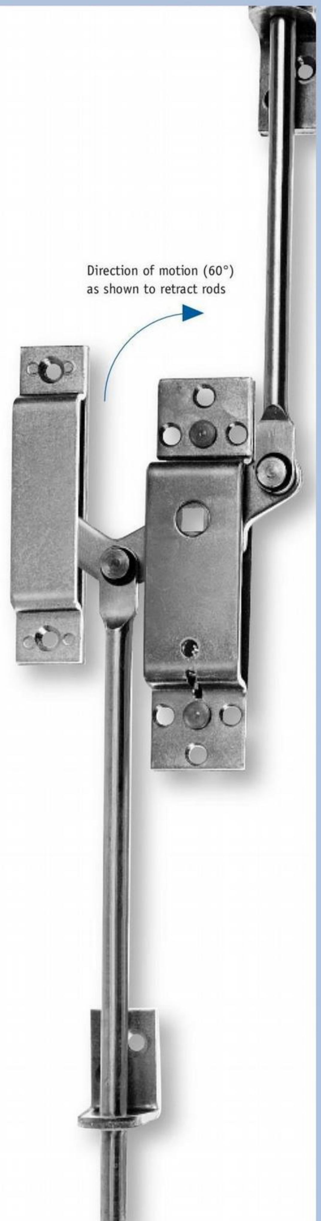
Left-hand rod latch 3/18254 (includes guides & keeper plate) shown fully extended, from inside.

'Keeper' dimensions 120 x 25 mm, maximum height 12 mm, hole centres 101 mm Centre 'tongue' & guide thickness, 4 mm Rod dimensions : 10 mm dia. x 1145 mm length.