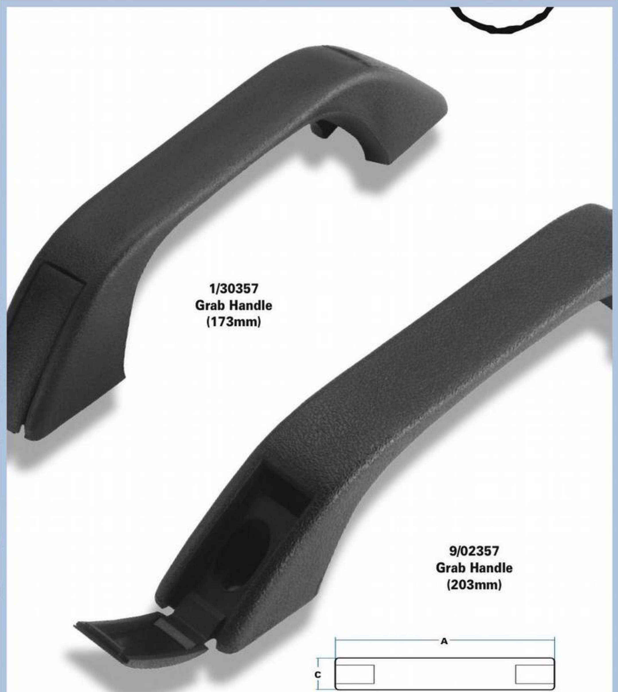
1/30357 Grab Handle (173mm)