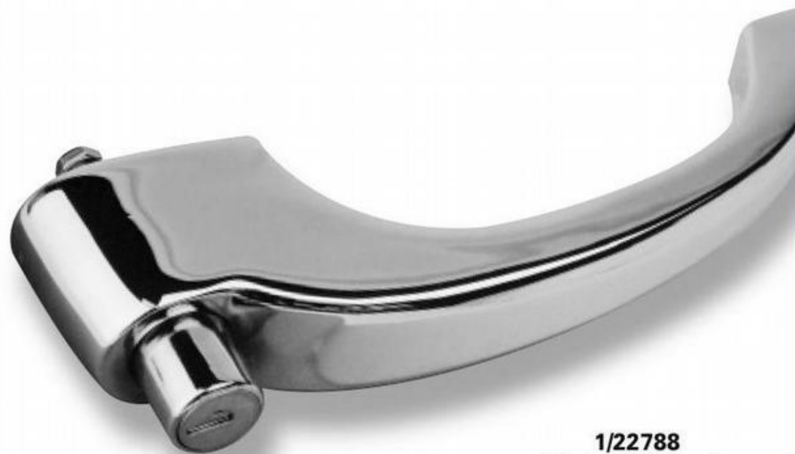
1/22788 'High-grip' handle