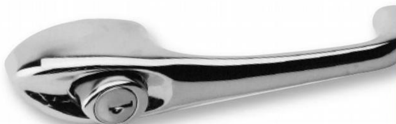
1/07986 'Classic' push-button handle

An adjustment nut allows simple, on-site control of depth of travel of plunger screw.